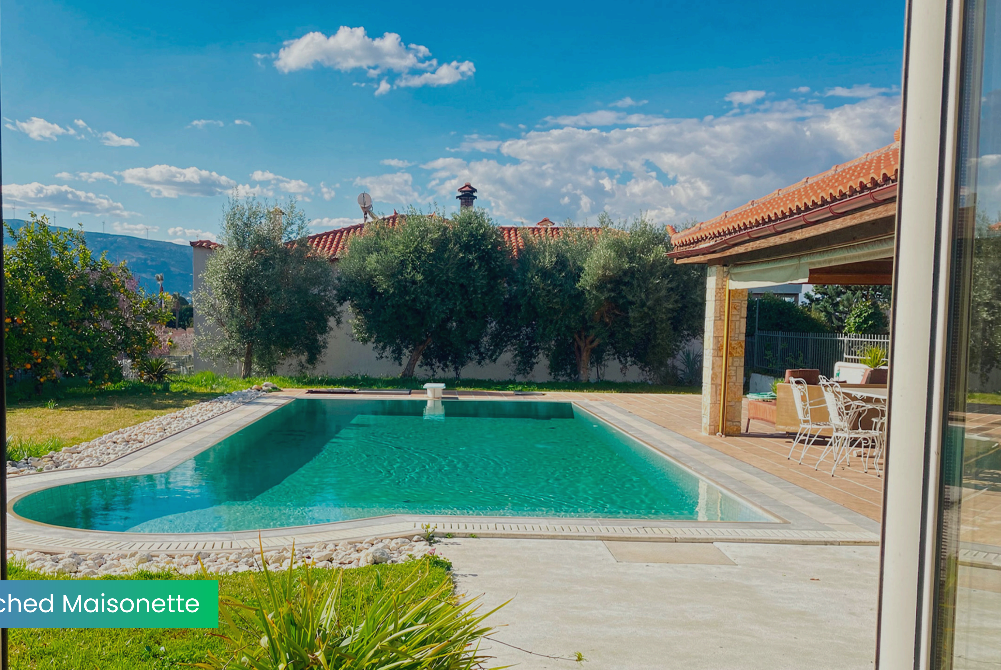
Luxury Detached Maisonette