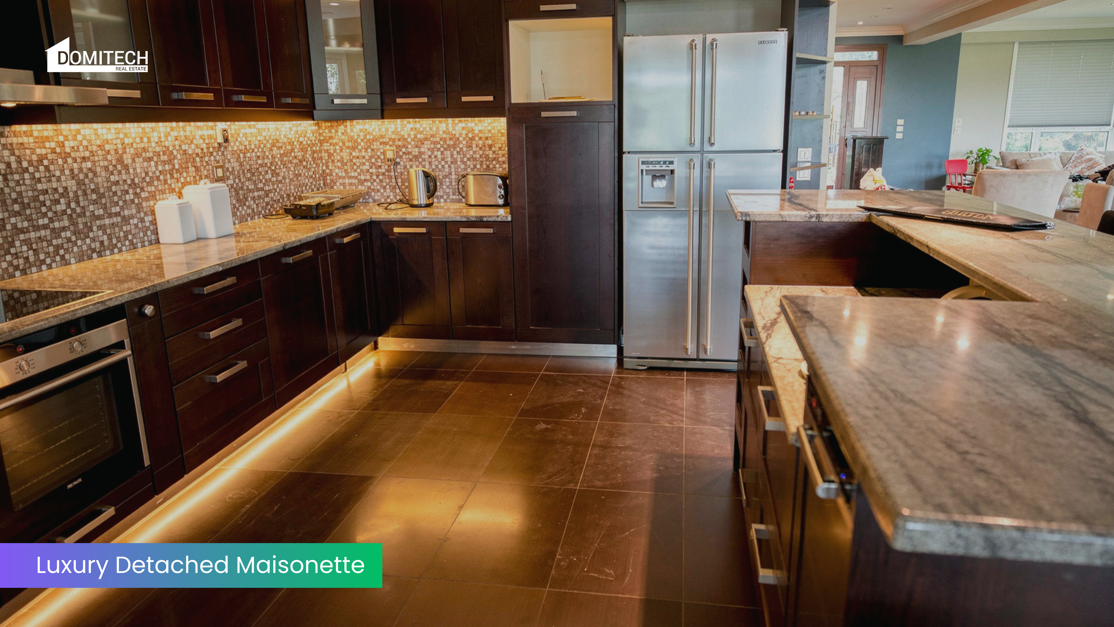
Luxury Detached Maisonette