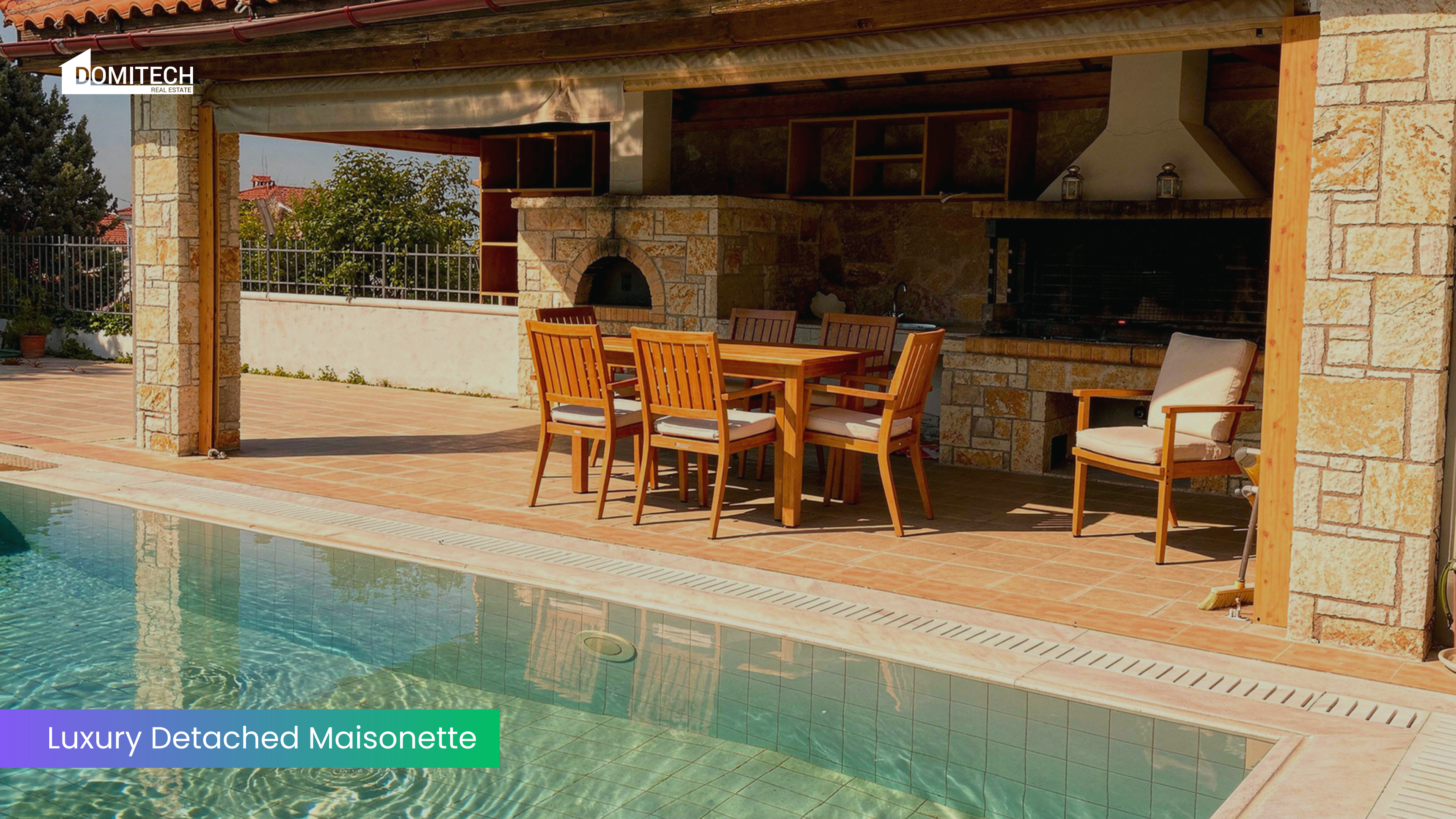
Luxury Detached Maisonette