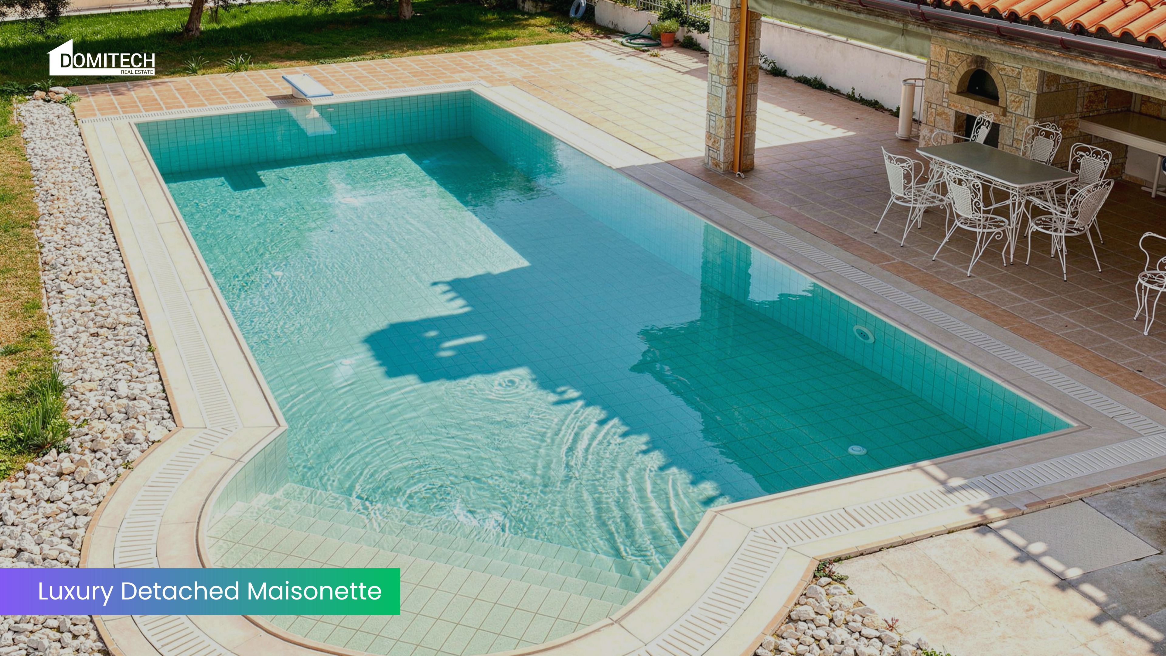
Luxury Detached Maisonette