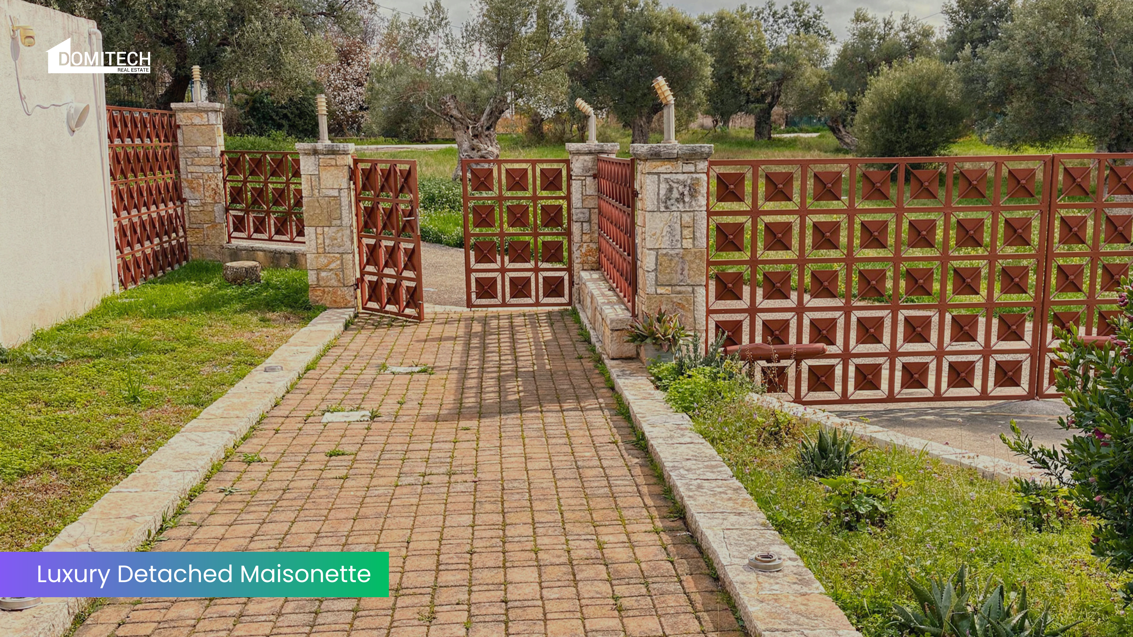
Luxury Detached Maisonette