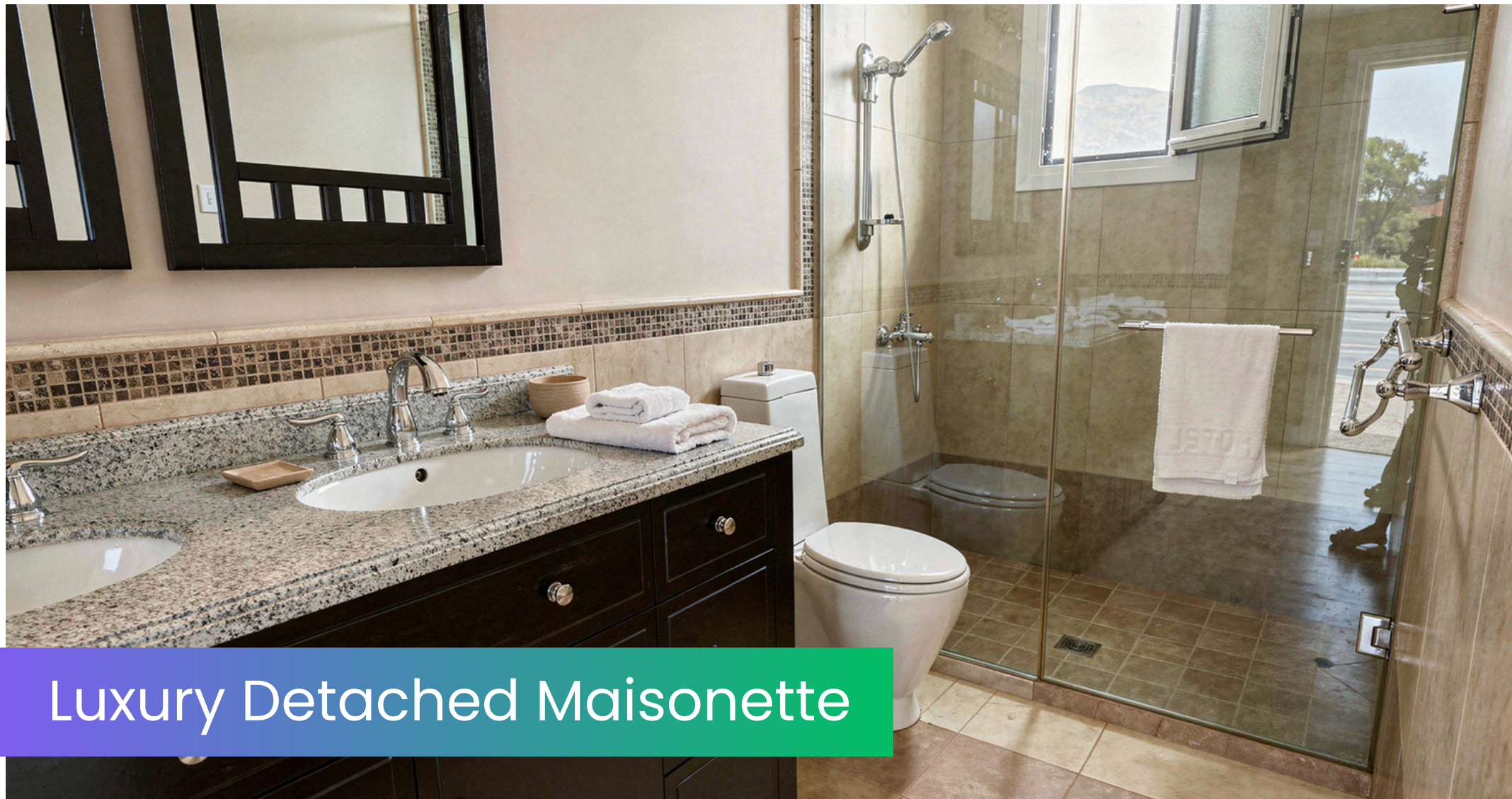
Luxury Detached Maisonette